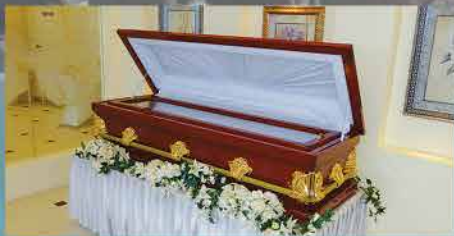
NV Harmony Casket 永康壽棺 (Decorative Flowers not included / 不含花飾)