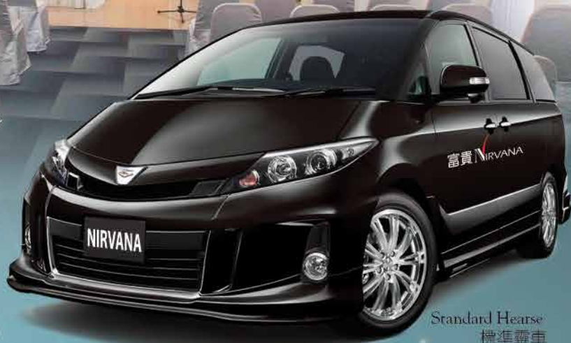
Standard Hearse 標準靈車