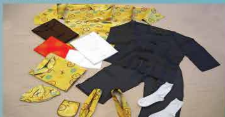
Imported Longevity Costume 進口優質壽衣與壽內