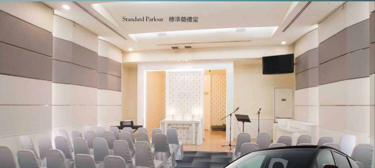
Standard Parlour 標準奠禮堂